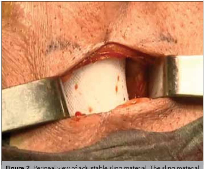
Figure 2. Perineal view of adjustable sling material. The sling material was placed at the bulbourethral junction

Trigo-Rocha et al. (37) reported 70% success of continence in a short-term follow-up with peri-urethral balloons which were placed in the transperineal using the guidance of fluoroscopy, urethroscopy or ultrasonography and was inflated 8 mL or until continence was achieved. Koncjancic et al. (38) reported a high rate of complication of periurethral balloons and also they removed the balloons from 17% of the patients.