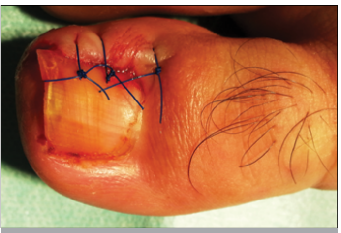
Figure 3. Postoperative appearance