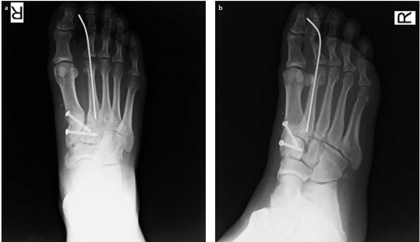
Figure 3. a, b. Fixation using two cannulated screws and a K-wire: (a) AP and (b) oblique radiographs