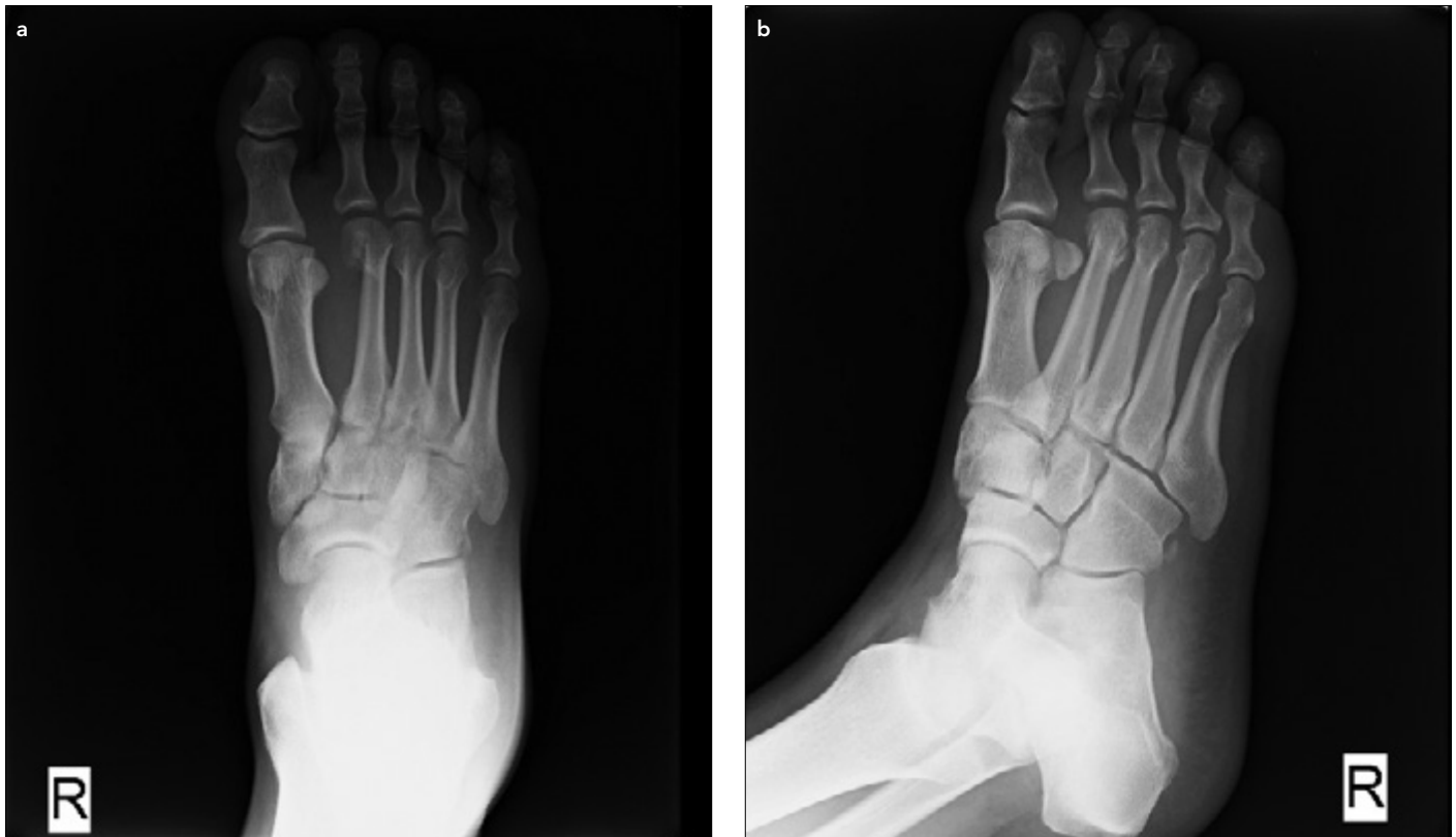
Figure 1. a, b. (a) Anteroposterior (AP) and (b) oblique X-rays showing the Lisfranc injury and metatarsal neck fracture

Lisfranc injuries usually result from one of three mechanisms: lateral translocation of a metatarsal caused by forced abduction of the forefoot; axial weight-bearing when the toes are dorsiflexed and ankle is in the equinus position; and crush injury trauma involving plantar translocation caused by force acting on the dorsal metatarsal (6). Our patient described a fall from height with the toes dorsiflexed and ankle plantar flexed (the second type described above). A fracture dislocation of the base of the first metatarsal usually occurs after such trauma. In this case, there was a fracture dislocation between the first metatarsal and medial cuneiform and neck fractures of the second and third metatarsals. In our case, the metatarsal neck fractures were probably caused by redirection of the axial force due to falling by the lifts in the front of his work shoes, which could have resulted in a rotational axial force to the forefoot and metatarsals.