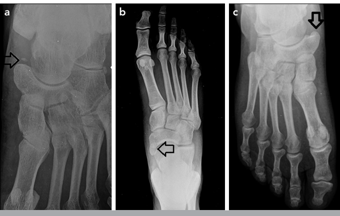
Figure 2. a-c. Types of accessory navicular bones (black arrows): (a): 24-year-old male with type I accessory navicula and os peroneum. Accessory navicula is a separated small accessory fragment located on the posterior tibialis tendon. Os peroneum (white arrow) is also seen at the calcaneocuboid joint. (b): 18-year-old female with type II accessory navicula. It is a bony fragment separated from the navicula. (c): 44-year-old female with type III accessory navicula. The united bone is seen as a protrusion of the navicular bone