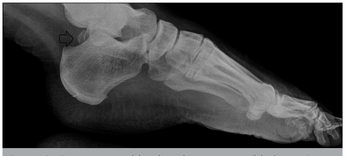
Figure 3. Forty-six-year-old male with os trigonum (black arrow) seen on a lateral foot radiograph

Os vesalianum is localized adjacent to the base of the fifth metatarsal and may be confused with avulsion fracture. An uncorticated sharp fracture line is the key point to distinguish the fracture from the accessory bone (3, 7).