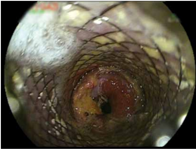
Figure 5. Endoscopic images after stent placement

is 30%–50% in different series, which is considerably high (3). If excessive bleeding occurs after endoscopic and pharmacological treatment failure, balloon tamponade is generally used until permanent treatments, such as TIPS or shunt surgery, are performed. SEMS, with a minor complication rate, is an alternative method to balloon tamponade as a bridging therapy. Wright et al. (4) successfully performed stent placement for 10 patients with refractory variceal bleeding. Patients' disease etiologies were cirrhosis secondary to Hepatitis C and alcohol and primary biliary cirrhosis.