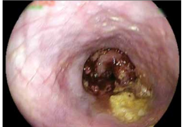
Figure 3. Distal esophageal varices after stent removal

Partial thrombus in the main portal vein lying to the left and right portal veins, tense ascites, and pleural effusion were demonstrated on CT Angiography. Transjugular portosystemic intrahepatic shunt (TIPS) was performed on the 13 th day after stent placement. The portal venous pressure was 37 mmHg