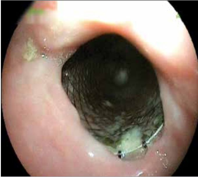
Figure 1. Endoscopic and fluoroscopic images of the variceal stent