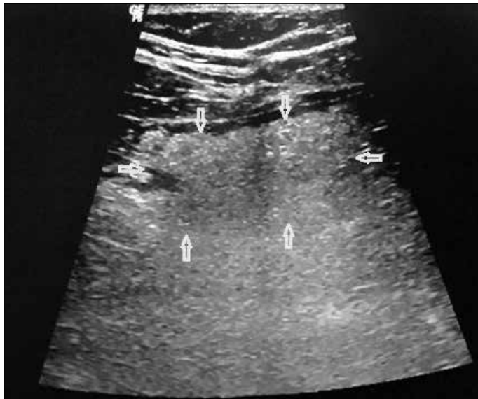
Figure 2. Ultrasonography revealed that a focal region of heterogeneous increased fat density (arrow)