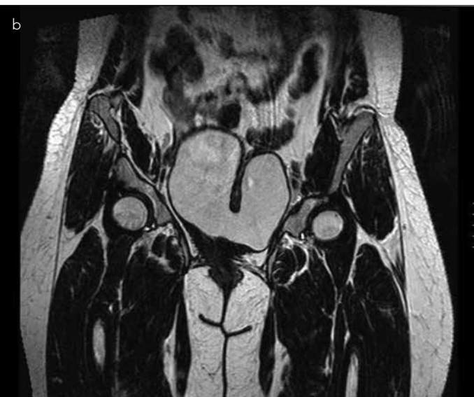
Figure 2. a, b. MRI appearance of incomplete sagittal bladder duplication on a transverse plane (a), MRI appearance of incomplete sagittal bladder duplication on a coronal plane (b)

Lower urinary system abnormalities are usually diagnosed either at birth or during childhood when US examination, for any reason, is performed into the urologically asymptomatic patient or when causes of urinary tract infections are evaluated. However, there are two cases with BD that remained asymptomatic for more than 5 decades in the English literature (5, 6). Our patient was relatively older at the time of diagnosis since she had no symptoms related to BD.