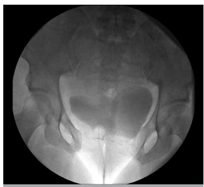
Figure 1. Voiding cysto-urethrography showing incomplete bladder duplication