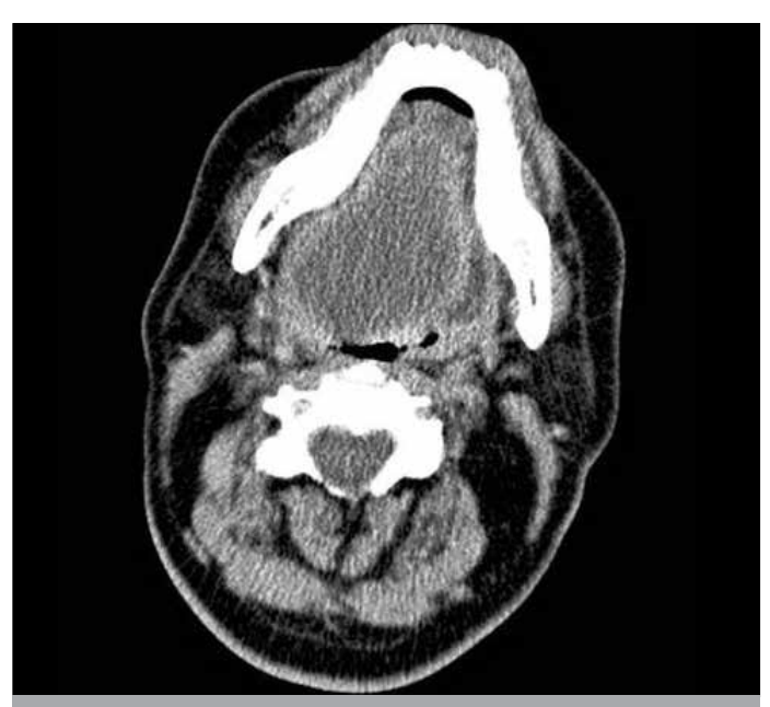
Figure 1. Computer tomography scan of the abscess