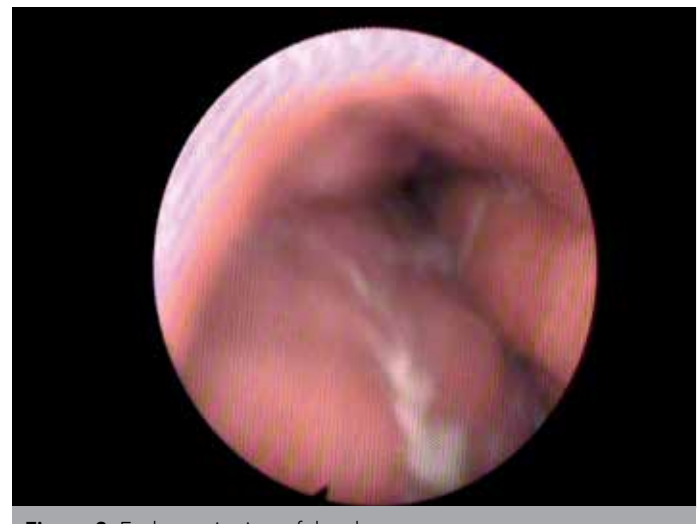
Figure 2. Endoscopic view of the abscess

the airway and subsequently draining the abscess under general anesthesia was last decision. However, patient did not conform to the tracheotomy; therefore, it was decided to try intubation in awake condition. After urgent tracheotomy preparations, the patient was intubated by anesthesia team with the help of flexible endoscopy in awake condition. Abscess (approximately 150 cc pus) was drained (Figure 3). Nasogastric probe was placed for feeding and decided not to extubate for edema in airway to pass. Two days after the operation, the patient was smoothly extubated, oral feeding was started, and general state and blood values had improved. Six days after the operation, the patient was discharged from the hospital. Consent form was taken from the patient for this paper.