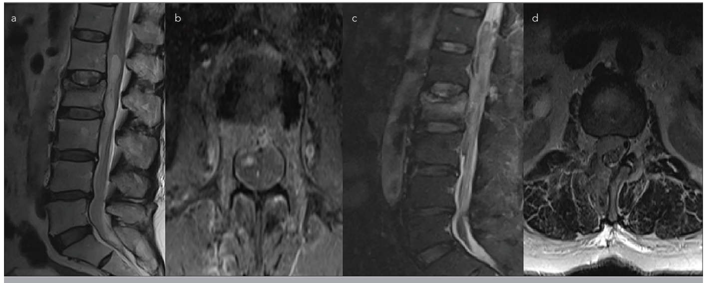
Figure 2. a-d. Postoperative T2 sagittal MR images revealed intraspinal hemotoma (a)Postoperative contrast-enhancedaxial MR images revealed subdural hemotoma (b)After second operation, T2 sagittal MR images revealed epidural hemotoma (c)After second operation, T2 axial MR images revealed epidural hemotoma (d)

(Figure 1. a, b). She was admitted to our clinic for balloon kyphoplasty. After routine preparations, she underwent a bipedicular L2 vertebral kyphoplasty (Figure 1. c, d). Following kyphoplasty, her pain had completely resolved, and she had no neurological deficit. To prevent postoperative development of pulmonary embolism, she was prophylactically administered 6000 units of low molecular weight heparin.